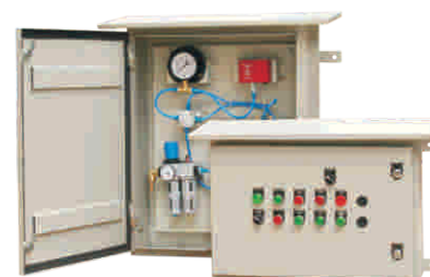
CONTROL PANEL FOR SECONDARY MC CLEANER