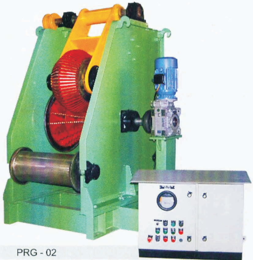
PRG - 02

*Due to constant research and development specifications are subject to change.